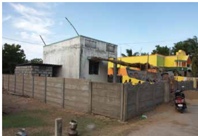
Madavamedu, Tamil Nadu. Left: A woman explains the alterations she is making. Right: Unaltered house with a house with major extensions behind.

A. Where relocation is clearly contrary to the wishes of the community concerned, CARE should not participate in the project and should instead concentrate on supporting the community to access effective representation and supporting them in other ways.